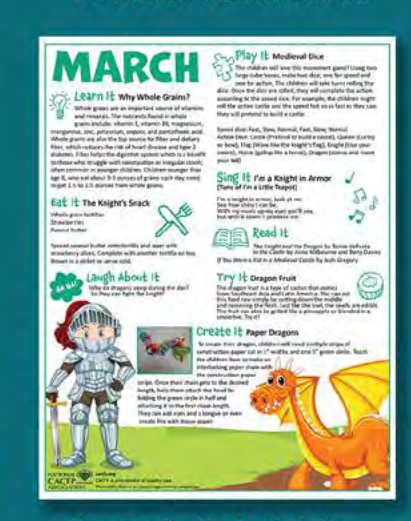
Curricula & Activities