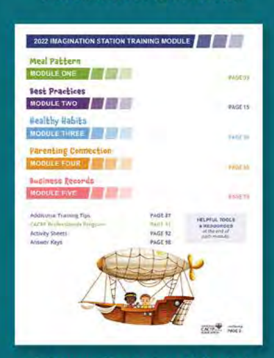
5-hour Training Module