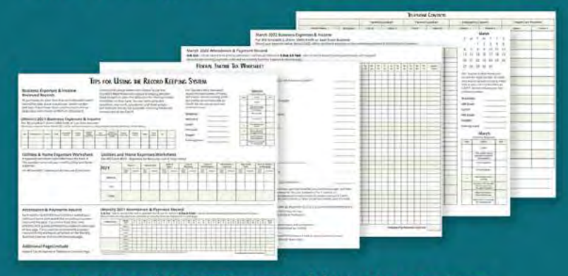
Optional CACFP record-keeping system